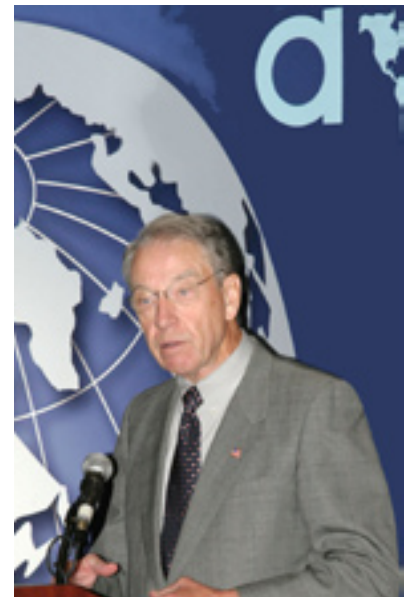
Senator Charles E. Grassley

The Senator spoke candidly for almost an hour about tax legislation, how things work in congress, the role of small and medium sized businesses, and the current state of the IRS and what their role should and shouldn't be.